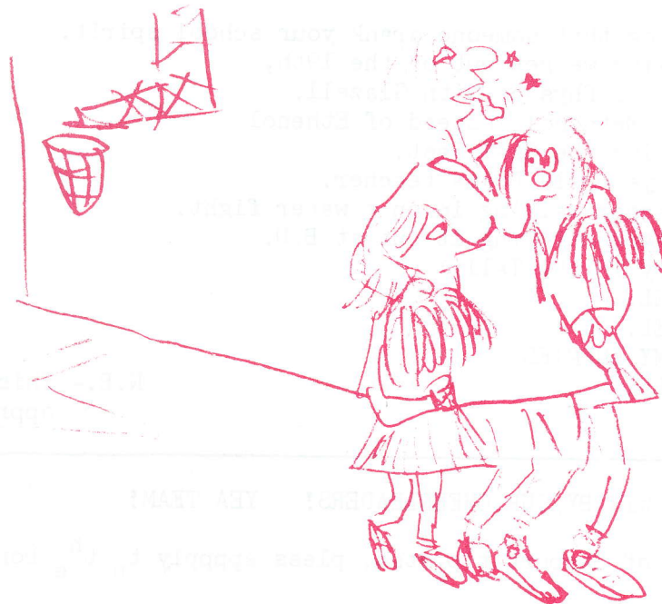
"THERE GOES OUR STAR CHEERLEADER ALFREIDA BASHTRASH, OUT FOR THE SEASON WITH A BADLY SPRAINED TONGUE.